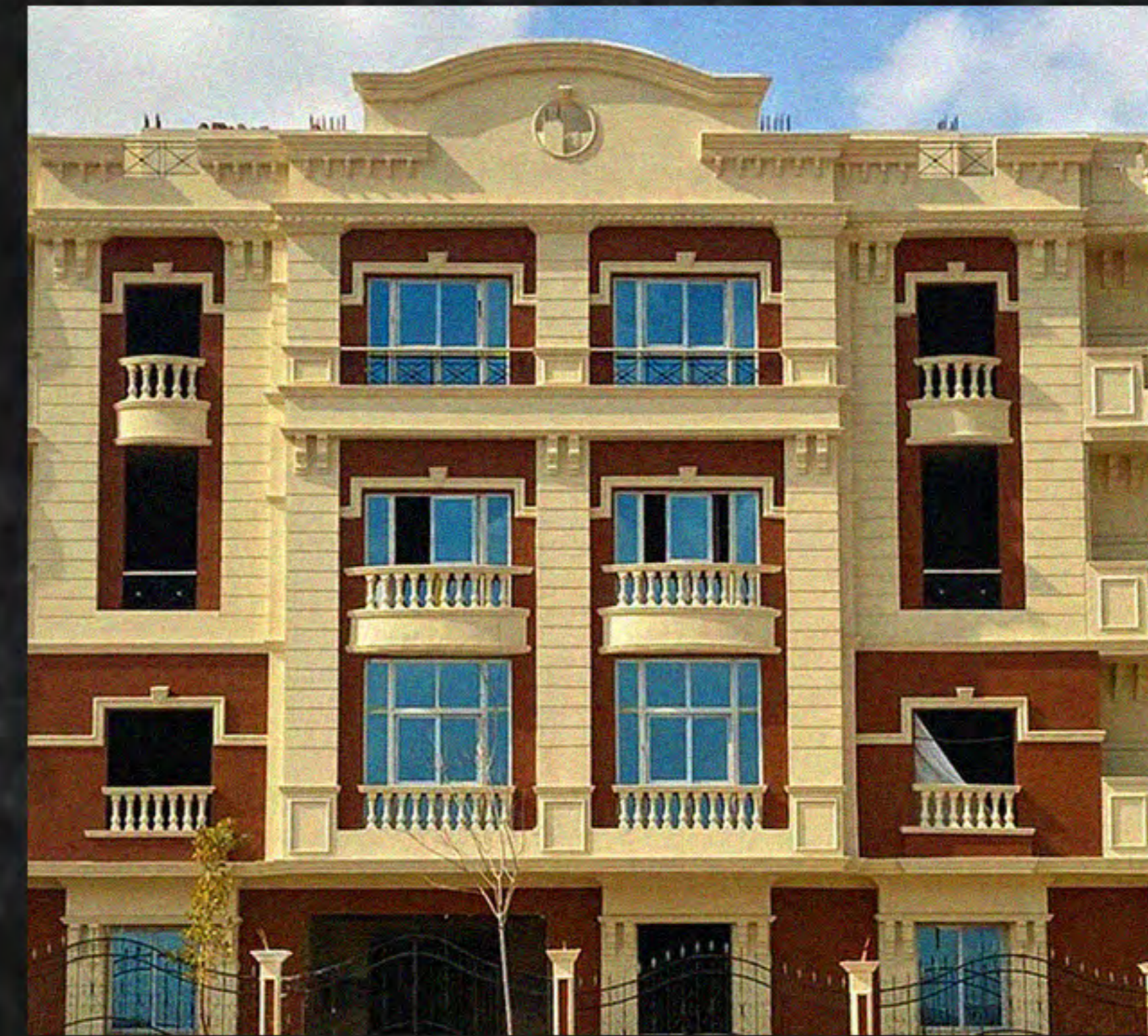
Seventh District Villas